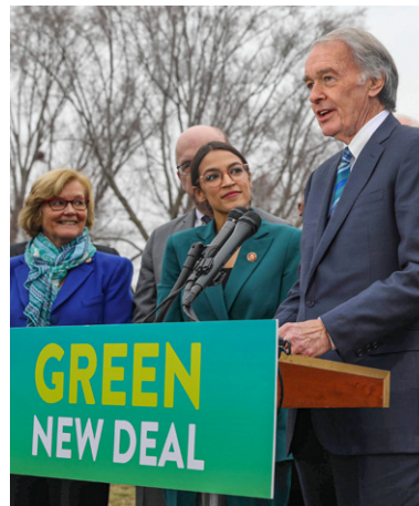
Rep. Ocasio-Cortez and Sen. Markey introducing the Green New Deal

Voters began to right the ship in 2018 by sweeping progressive champions from across the country into the House. This new majority went to work right away to hold the Trump administration accountable and pass legislation that prioritizes people. The first bill passed by the House in 2019 was H.R. 1, the For the People Act, a series of democracy reforms. The House continued, passing nearly 500 bills including legislation to protect the Arctic Refuge from drilling, make Washington DC the 51st state, protect our coasts from offshore drilling, and more. Representative Alexandria Ocasio-Cortez (D-NY) and Senator Ed Markey (D-MA) introduced the Green New Deal, with hundreds of co-sponsors and the House rejected the Trump administration's reckless spending cuts.