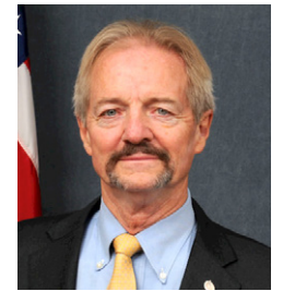
Foxes in the Henhouse: Wheeler, Bernhardt and Pendley.

EPA Administrator Andrew Wheeler is a former coal industry lobbyist. During his time as administrator he has engaged in an all-out assault on the Clean Water Act. Wheeler's EPA has stripped Clean Water Act protections from 1 in 5 stream miles across the country and roughly half of the nation's remaining wetlands. He has weakened rules for the disposal of dangerous coal ash and has finalized rules to allow dirty power plants to spew even more toxic wastewater into our lakes and streams. Wheeler has consistently undermined science, supported budgets that would have devastated the agency, and has slowed efforts to tackle the climate crisis.