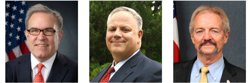
Foxes in the Henhouse: Wheeler, Bernhardt and Pendley.

The Senate has a duty to vet and approve or disapprove of nominees for high level agency positions including cabinet members, federal judges, and nominees for the Supreme Court. During the Trump administration, the Senate has confirmed disastrous nominees who come from the industries they are charged with regulating. After Environmental Protection Agency Administrator, Scott Pruitt, and Department of the Interior Secretary, Ryan Zinke, both resigned after becoming engulfed in scandals, the Senate confirmed their replacements.