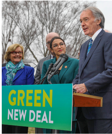
Rep. Ocasio-Cortez and Sen. Markey introducing the Green New Deal

Voters began to right the ship in 2018 by sweeping progressive champions from across the country into the House. This new majority went to work right away to hold the Trump administration accountable and pass legislation that prioritizes people. The first bill passed by the House in 2019 was H.R. 1, the For the People Act, a series of democracy reforms. The House continued, passing nearly 500 bills including legislation to protect the Arctic Refuge from drilling, make Washington DC the 51st state, protect our coasts from offshore drilling, and more. Representative Alexandria Ocasio-Cortez (D-NY) and Senator Ed Markey (D-MA) introduced the Green New Deal, with hundreds of co-sponsors and the House rejected the Trump administration's reckless spending cuts.