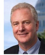
Sen. Van Hollen