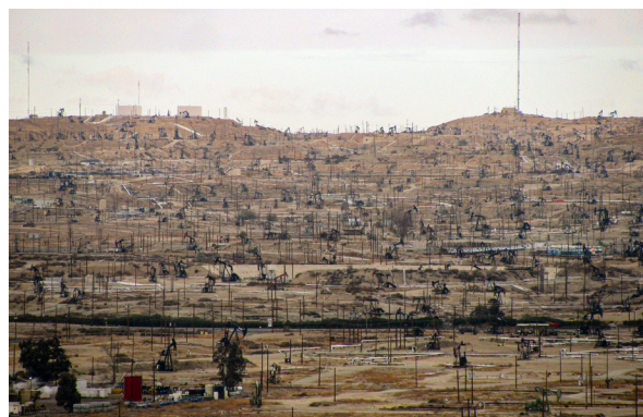
▲ Kern River Oil Field, located on one side of Lost Hills, is one of the largest oil fields in California.

Using data from pollution monitors and community logs Clean Water Action has identified peaks and strong odors in the mornings before 8:00 AM. This is generally the time parents head out to work and children go to school. Clean Water and community partners advocated with the California Air Resources Board SNAPS staff to send their mobile monitor during those times and are waiting to hear back the result of their investigation. At the first community meeting in November SNAPS staff will be reporting back on their results from both their stationary monitor and their mobile monitor.