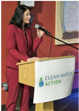
◀ Attorney General Dana Nessel delivering the keynote address.