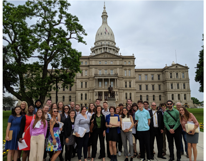
Lobby Day at the Michigan State Capitol.

Fixing Michigan's roads and ensuring that all residents have access to clean, affordable drinking water were clear priorities for Michigan voters in 2018. Now it is up to State House and Senate leadership to work with Governor Whitmer to make that happen. Unfortunately they have chosen to play partisan political games so far instead. While Governor Whitmer has a clear plan that will fix the roads while freeing up general fund revenue for general fund purposes, like rebuilding our water infrastructure, no clear plan has even been proposed by legislative leaders. Even with one-party rule,