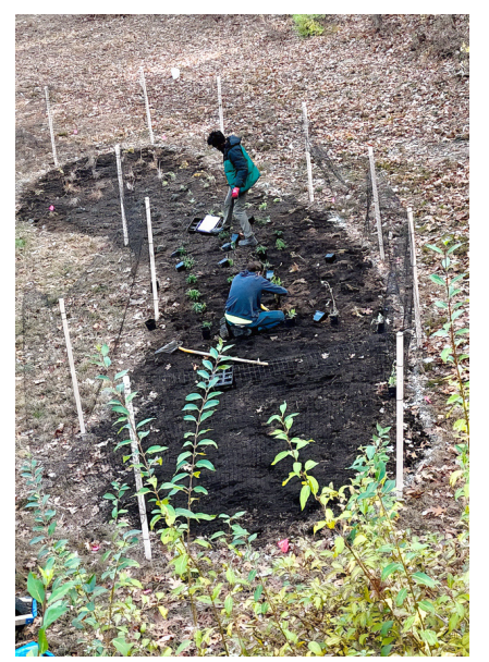
continued on next page

Our Maryland office is quite active during Maryland's 90-day legislative session, which ends on April 8. Our priorities this year include ending renewable energy subsidies for burning trash, improved public disclosure of Superfund sites and their risks, expanding grant opportunities for compost, and continuing to educate legislators about the critical need to invest in better septic systems. We are also working with schools to help them navigate Maryland's program for in-school compost and food waste reduction, a program enabled by legislation we helped pass in 2022.