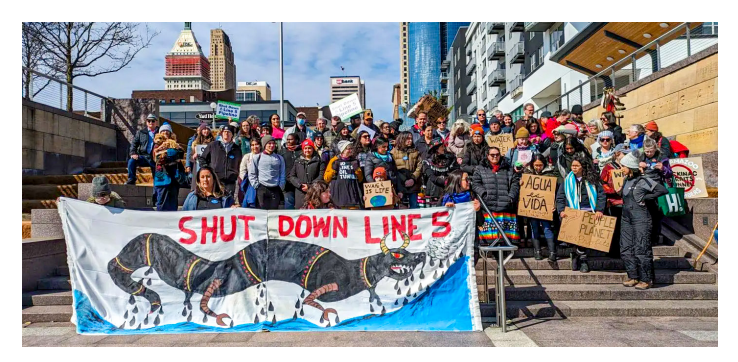
▲ Clean Water Action staff and volunteers with the Oil and Water Don't Mix coalition rallied in Ohio in March as Line 5 was being heard in US District Court.

Our campaign to shut down Enbridge's Line 5 pipeline continues. In March, a documentary called Bad River aired in 12 major cities nationwide. The film chronicles the history of the Bad River Band of Lake Superior Chippewa from the treaty they signed in the 1800s through their ongoing fight for their sovereignty and to shut down Line 5 on their reservation lands in northern Wisconsin. It is a deeply inspiring film that is getting a lot more people across the country looking at the dangers we face from Enbridge and their unnecessary and unsafe Line 5 pipeline. We are proud to stand with the Bad River Band as we work together to shut down Line 5 before a catastrophic rupture of the pipeline changes the Great Lakes forever.