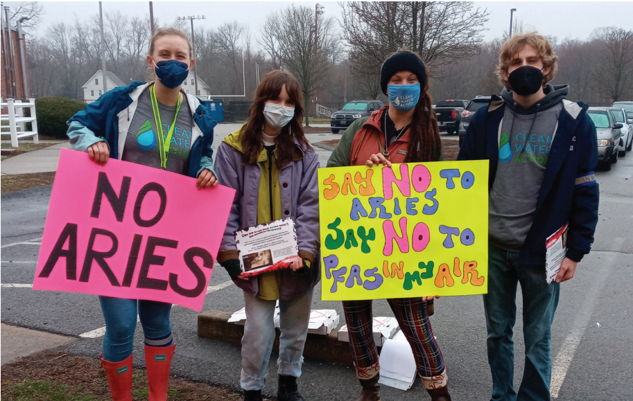
20th Annual Breakfast of Champions