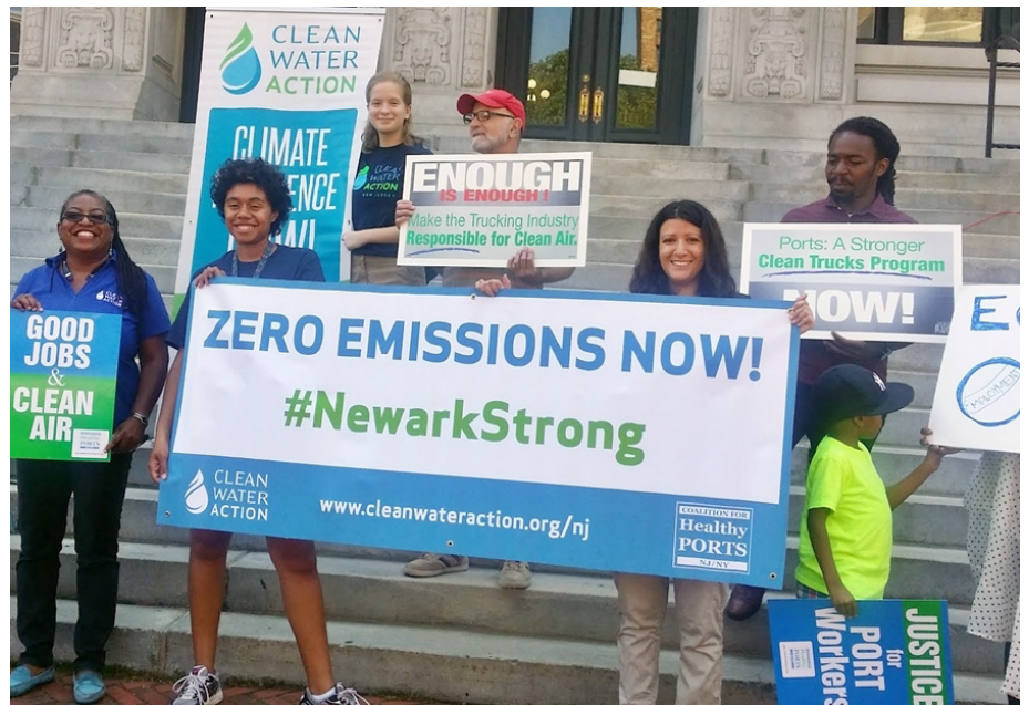
Clean Water Action and Healthy Ports rallying for #ZeroEmissionsNow on the steps of Newark City Hall.

At CHP's request, PANYNJ undertook a port channel simulation to determine if the air pollution control technology could be mobile by installing it on barges and still have enough room for emergency