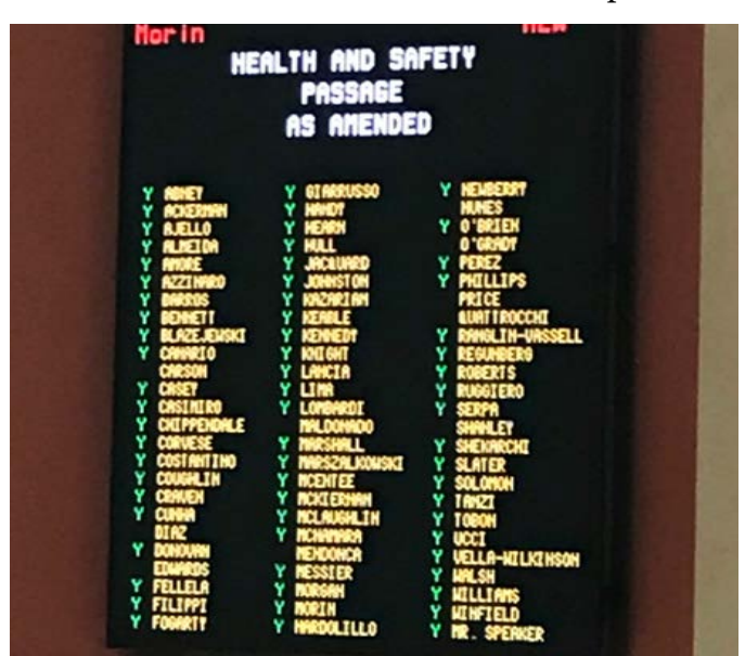
▲ Victory! The vote count as Rhode Island passes H5028, banning Flame Retardants.

In response to a major push led by Clean Water Action, health experts and firefighters, the Rhode Island House of Representatives voted to pass H5082 in special session this fall. The Senate had already unanimously passed this bill earlier in the session. Starting in 2019, Rhode Island law will require the phase out of organohalogen flame retardants (a group of chemicals that covers most of those used today) in items like couches, highchairs, electronic toys, car seats, and many more common household products. Rhode Island is the first state in the nation to ban the use of the entire class of chemicals in both furniture and children's products.