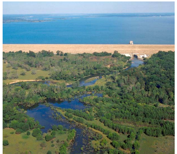
ABOVE: Lewisville Lake and Dam in Denton County, Texas. The BLM canceled auctions of leases that would have allowed fracking adjacent to the Lake and other drinking water sources.