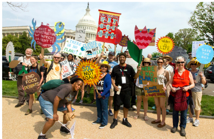
Part of the East Baltimore bus to the People's Climate March.

The coalition quickly blossomed to over 25 groups including representatives of faith, labor, Latinx rights, criminal justice, workers rights, fair development, transportation equity, economic justice, and more movements in the city. At twice monthly meetings that became weekly in the month before the March, the groups coordinated community outreach