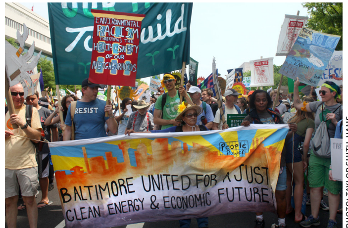
In the weeks before the march, local artists organized a series of "art builds" to bring Baltimore's voice to the march.