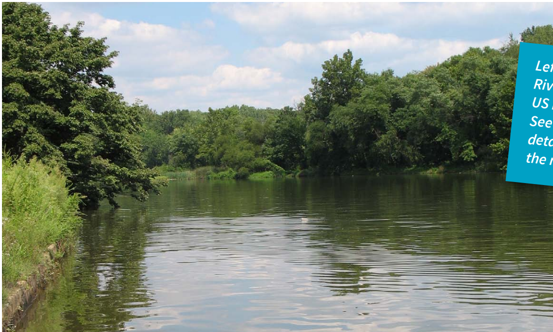
Left: The Anacostia River adjacent to the US National Arboretum. See p.7 for article detailing efforts to rid the river of pollution.

NON PROFIT ORG U.S. POSTAGE PAID BOSTON MA PERMIT No 51544