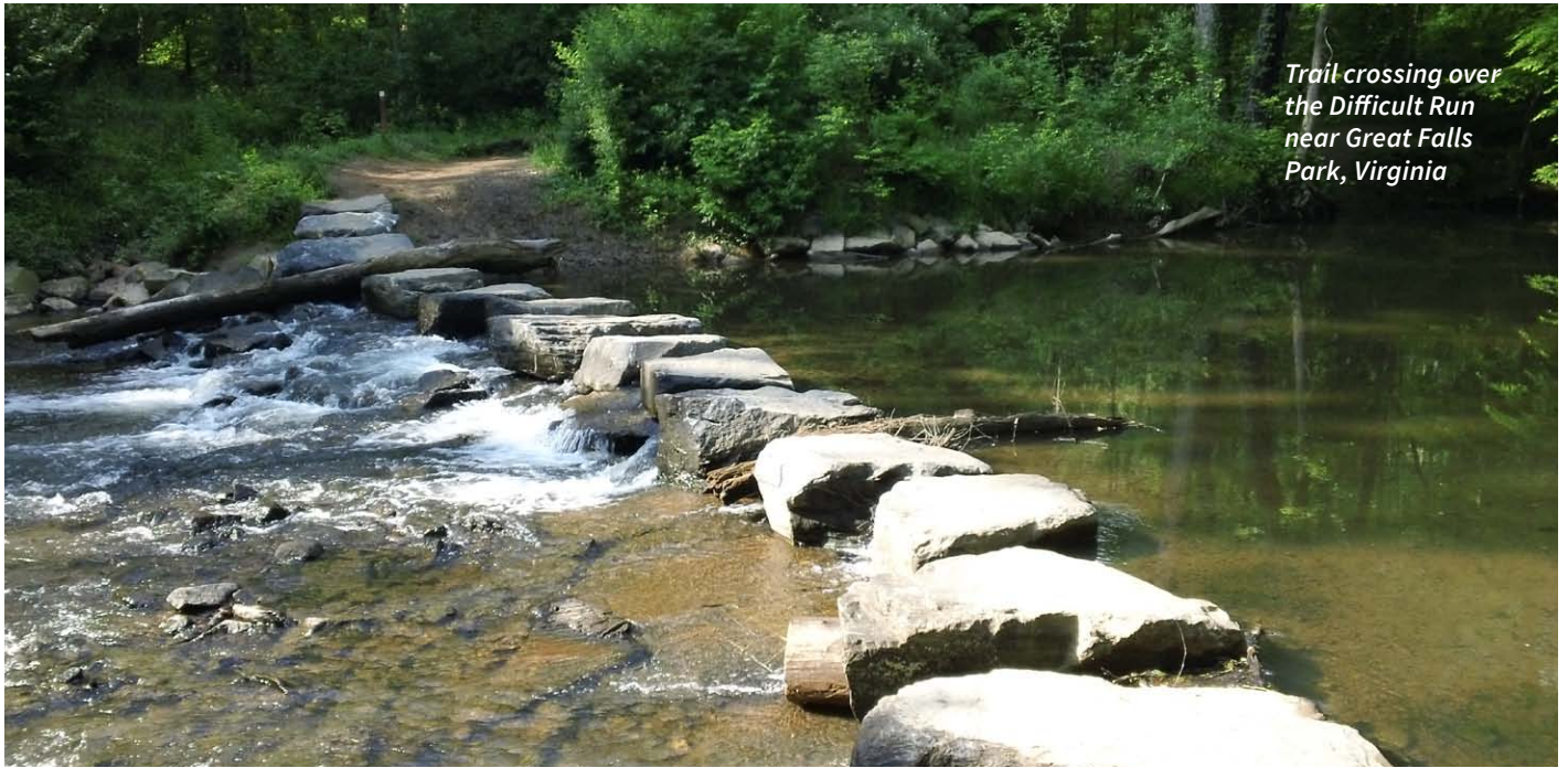
Trail crossing over the Difficult Run near Great Falls Park, Virginia