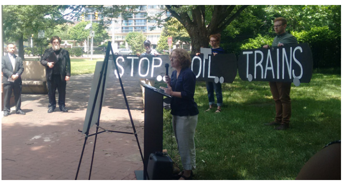
Clean Water Action and Blast Zone residents held a press conference near the site of a train derailment in downtown Baltimore to warn what could have happened if the train had been carrying crude oil.

Unfortunately crude oil trains still travel through Maryland: some cars to an existing transfer terminal in South Baltimore to offload onto ships, others on their way to refineries and terminals in Philadelphia and New Jersey. While crude oil train transport has dramatically increased over the past five years, public knowledge and preparedness for a potential oil train explosion has not.