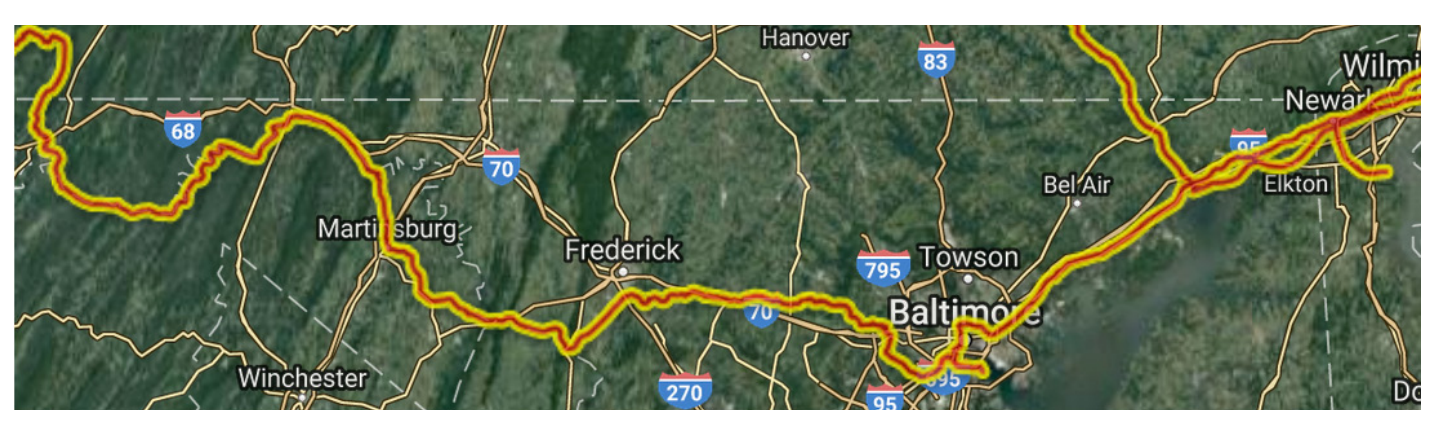
This map, produced by Stand, shows the route that oil trains take through Maryland. To see if you live in the Blast Zone, visit http://explosive-crude-by-rail.org/

Clean Water Action also worked to pass the Maryland Rail Safety Act in the 2016 General Assembly session, which would have raised the fee on crude oil transfers in Maryland to pay for commonsense safety regulations and increased inspections. Although the bill did not pass, advocacy for state action on crude oil trains will continue. These shipments are too dangerous for the rails anywhere, but until the federal government takes action, it's up to local and state governments to protect their residents from exploding oil trains.