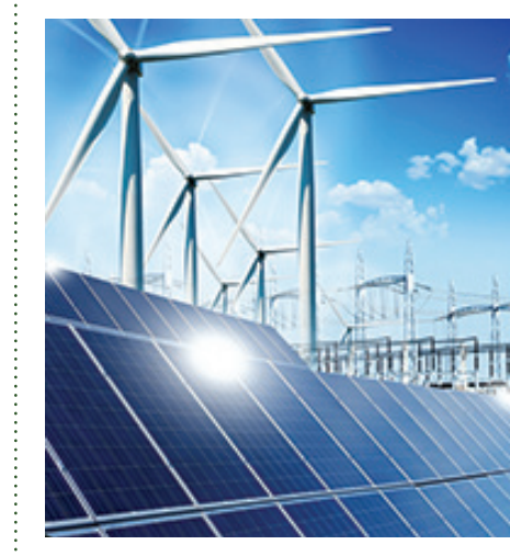
There is no need for the new fossil fuel projects.

The new fossil fuel projects will not only dramatically increase GHG's, but effectively choke off the development of clean new energy sources. According to research by Oil Change International<sup>27</sup>, pipelines not only enable the exploitation of oil and gas reserves, but also lock in the use of oil and gas even as policies and markets shift