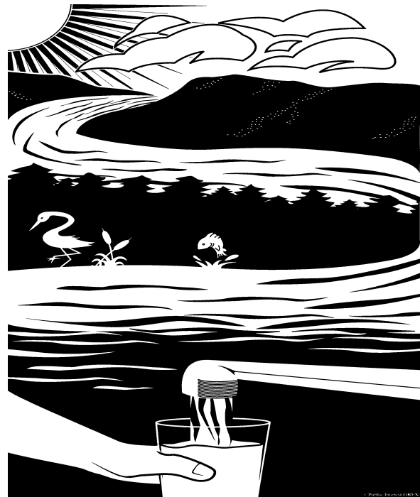
From Watersheds to Watertaps:

For information about how to participate in elections for state leadership of Clean Water Action, please call NJEF's State Office at 732-280-8988.